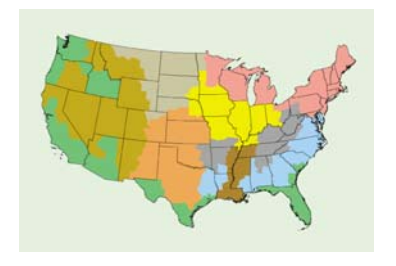
Native Plants for Pollinators