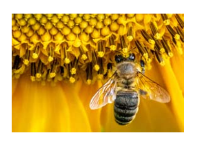
Beekeeper Resources Fact Sheet

Programs and Resources that support Beekeepers